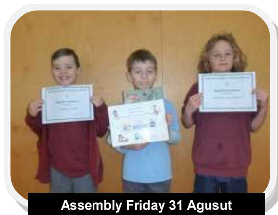
Assembly Friday 31 August