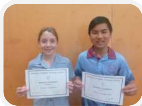
Assembly Monday 16 October