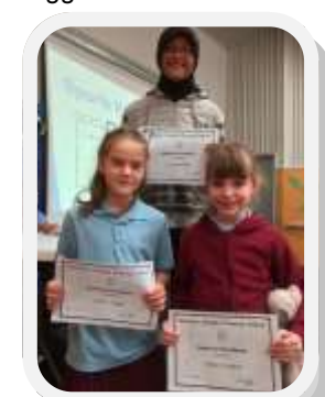
Monday 20 th February