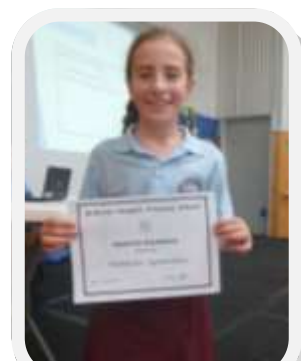
Monday 27 th February